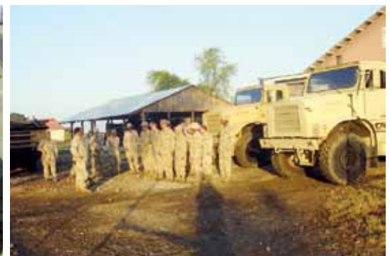
TOP: Hummers, dump trucks, bulldozers, and amphibious vehicles are based at New Missions. SIDE: Food has been distributed to our schools. The military has MREs (meals ready to eat) on pallets and are being delivered by the truck load. BOTTOM: The U.S. Military set-up a command center at New Missions and are fully supporting New Missions as we step forward after this earthquake.