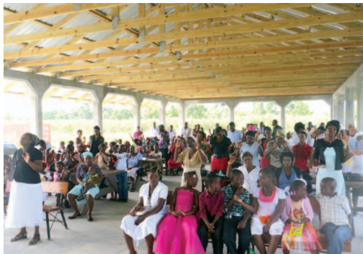
The very first church established by New Missions in Haiti now has a new building located in the village of Nepty.