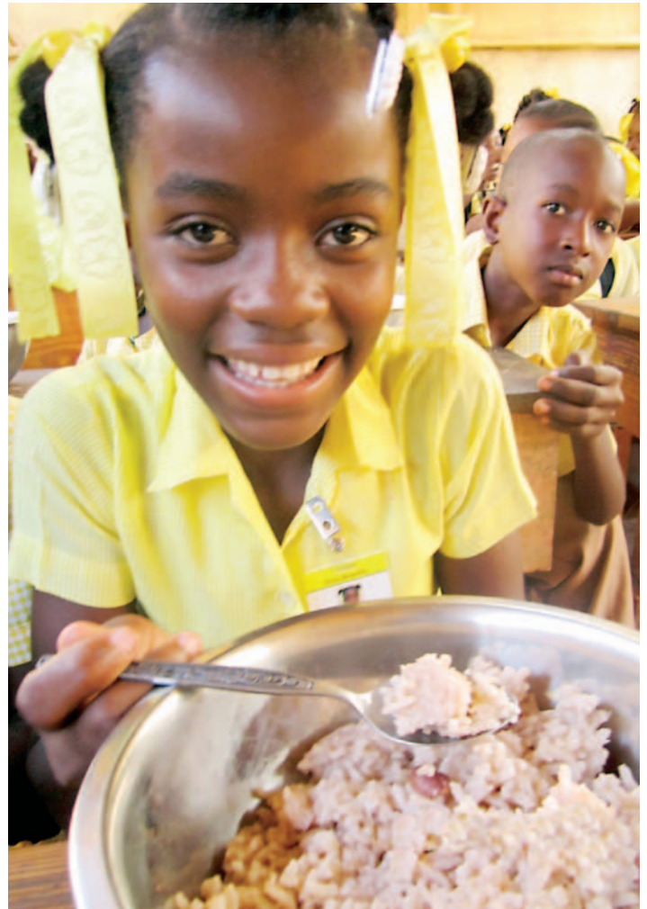
More than a bowl of food, the entire experience of being in school at New Missions is full of hope and joy for each child.