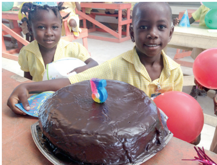
It's time to celebrate 5 th birthdays and we are thankful for each child growing healthy and strong.