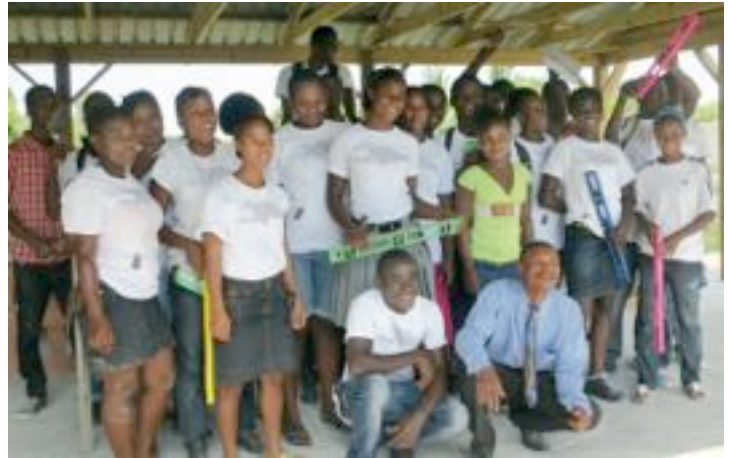
This year 30 students are attending the Trade School; they are excited about the potential for their future.

The greatest solution for poverty is jobs. The tool to make this possible is education and enterprise. New Missions is serving stronger than