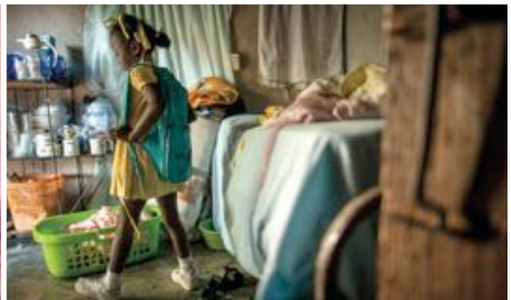
Middle: Each school uniform is made in the village by a seamstress—which provides employment and supports the local economy.