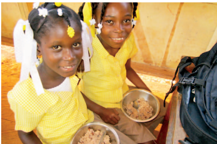
Above left: Friendship makes life better and your sponsorship makes it possible for students to come to a safe, caring and loving school. Above right: Monthly, food inventory is sent to each of our schools where cooks are on staff to prepare lunch each day for the students.