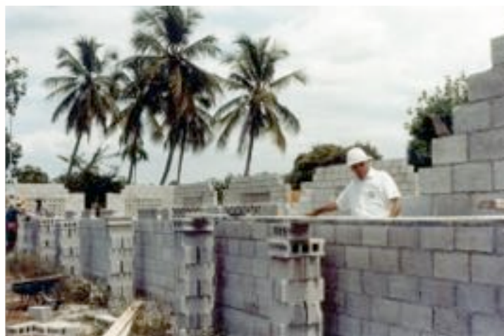
Above middle: “Haiti: Hope in God” has been our motto since we hung a banner between coconut trees to start our first church.