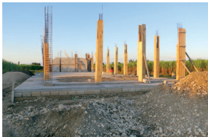
Middle: Our church and school construction is accomplished by an all Haitian crew, and provides 70 jobs—supporting the local economy. Above left: The land purchased for the Nepty church will also be home to our Bord-Mer Elementary School and a community soccer field. Above right: Partner with us to build more churches in Haiti, and together, with the power of the Gospel, change lives forever.