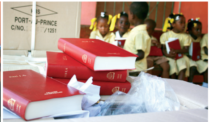
Middle: God's Word is like a well of living water for each of our students as they grow stronger in Him each day.