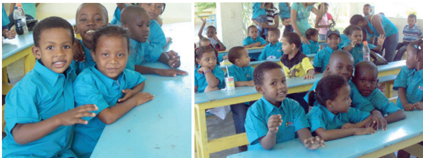
Above left: Happy students just received their first gift from New Missions—new school uniforms. Above middle: Coming to school is a happy new experience for these children in the Dominican Republic. Above right: The beautiful facilities at our preschool on the campus of Iglesia Nueva Vida are a blessing to the community.