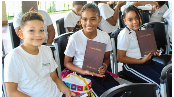
The Bible distribution to all of our students last year had an amazing impact in the lives of many.