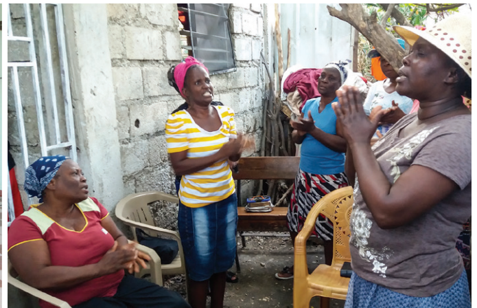
Top: Pray for women as they grow closer to God and care for their families.