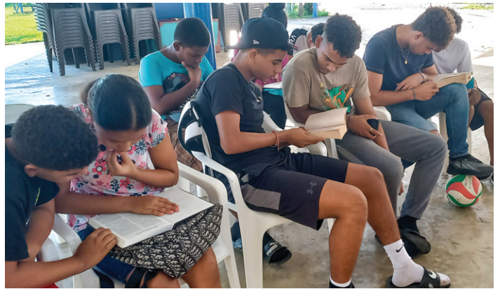
Some of the youth in Playa Chiquita studying the book of Genesis to prepare for a Bible memory competition.